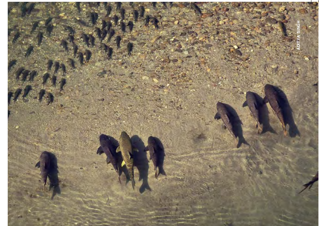
The clear waters of the Ramganga are home to an astonishing diversity of freshwater fish. More than 30 species are found here including the golden mahseer Tor putitora (above), an endangered and highly-prized sport fish.

On our way back to the forest rest house, we saw fresh tiger scat and pugmarks that led to a small cave surrounded by bushes. Earlier, I had seen a tiger across the Mandal river at close range, but this time, it was late and we did not want to take chances on a day when we had already had some narrow escapes.